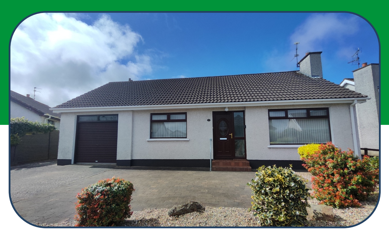
69 Castlewood Avenue, Coleraine, BT52 1JR